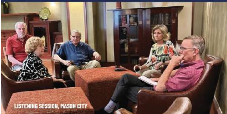
LISTENING SESSION, MASON CITY